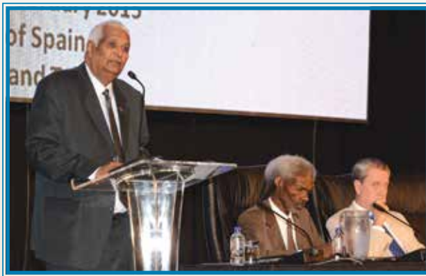
The Honourable Winston Dookeran addresses the First Preparatory Meeting towards the First Conference of States Parties to the ATT in Port of Spain