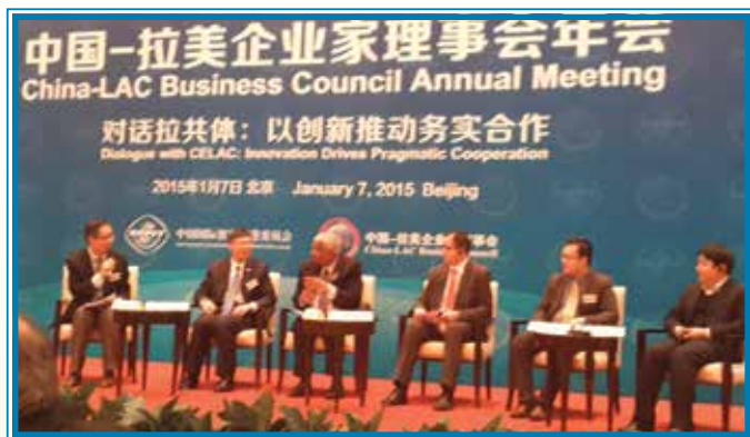
Third from left. The Honourable Winston Dookeran, Minister of Foreign Affairs with other participants during the China-LAC Business Council

Chinese business interests in Trinidad and Tobago have made significant headway in the areas of infrastructural development, public sector financing, information communication technologies (ICTs), and energy exploration and production. This view was expressed by the Honourable Winston Dookeran, Minister of Foreign Affairs, during his presentation on “China’s Investment in LAC countries and LAC countries Industrial Upgrading” at the China-Latin America and the Caribbean (LAC) Business Council Meeting in Beijing on 7th January, 2015.