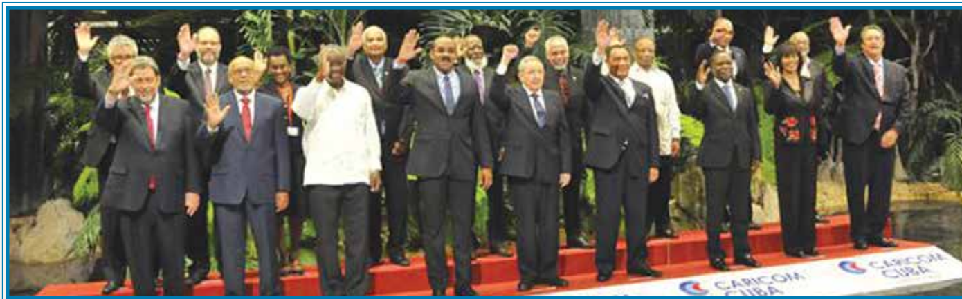
CARICOM leaders and Foreign Ministers with Cuba's President Raúl Castro at the V CARICOM-Cuba Summit

The CARICOM-Cuba Summit is held every three years with the purpose of strengthening relations and reviewing cooperation agreements between the member states of the Caribbean Community and Cuba.