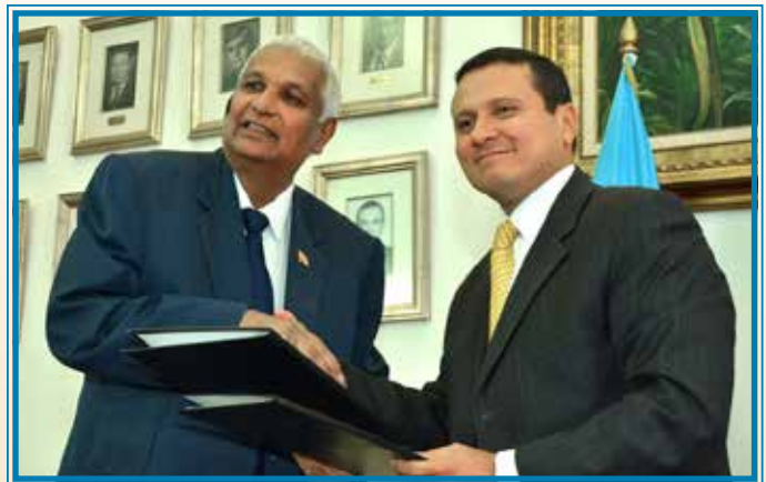
The Honourable Winston Dookeran, Minister of Foreign Affairs and H.E. Carlos Raúl Morales Moscoso, Minister of External Relations of Guatemala exchanging signed copies of the Partial Scope Trade Agreement between Trinidad and Tobago and Guatemala.

During the four rounds of negotiations, Trinidad and Tobago adopted a collaborative approach which involved extensive consultations with representatives from the public and private sectors. His Excellency Mervyn Assam, Ambassador Extraordinary and Plenipotentiary with responsibility for Trade and Industry was the lead negotiator for Trinidad and Tobago while Ms. Sonia Lainfiesta, Director of Trade Negotiations, Ministry of the Economy led the negotiations for the Republic of Guatemala.