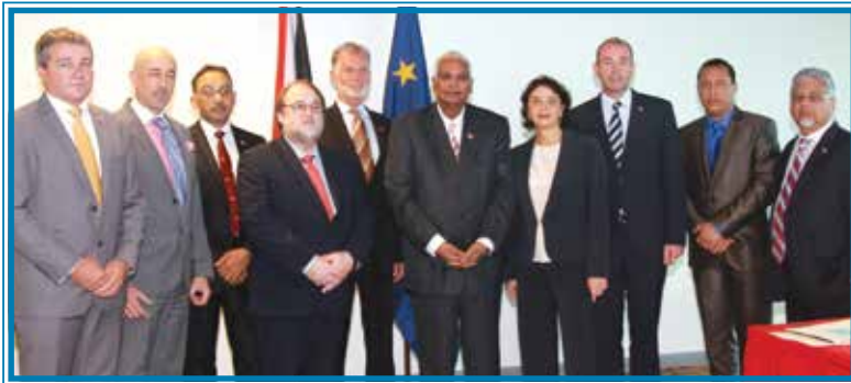
Minister Winston Dookeran, Minister of Foreign Affairs (centre) with participants of the Bilateral Political Dialogue between the Republic of Trinidad and Tobago and the European Union

The Honourable Winston Dookeran, Minister of Foreign Affairs, held a Bilateral Political Dialogue with the European Union on Monday 12th January, 2015 at the Ministry of Foreign Affairs. The Dialogue was held in the context of Article 8 (1) of the ACP-EU Cotonou Partnership Agreement, which calls for the Parties to "...regularly engage in a comprehensive, balanced and deep political dialogue, leading to commitments on both sides". Also participating in the Bilateral Political Dialogue were Senator the Honourable Dr. Bhoendradatt Tewarie, Minister of Planning and Sustainable Development, Senator the Honourable Vasant Bharath, Minister of Trade, Industry and Investment and Communications, and former Senator the Honourable Gary Griffith, Minister of National Security, who met with representatives of the European Union (EU) for discussions. The EU was represented by Ms. Daniela Tramacere, Chargé d'Affaires of the European Union Delegation to Trinidad and Tobago, along with the Heads of Mission of EU Member States resident in Trinidad and Tobago: Spain, The