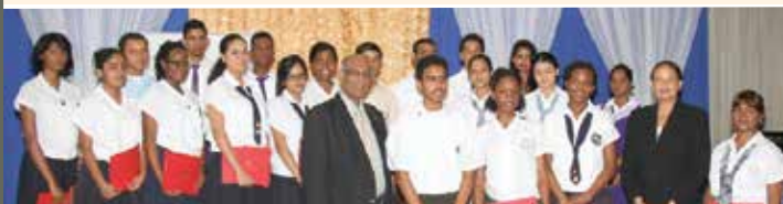
Dr. the Honourable Surujrattan Rambachan, Minister of Works and Infrastructure and Ag. Minister of Foreign Affairs and Ms. Frances Seignoret, Permanent Secretary (Ag.), Ministry of Foreign Affairs with the winners of the 5th Future Diplomats Essay Competition

The Ministry of Foreign Affairs of the Republic of Trinidad and Tobago honoured the winners of the 5th Future Diplomats Essay Competition on Friday 16th January, 2015. The competition was conducted during the period 15th September, 2014 to 24th October, 2014 in all secondary schools throughout Trinidad and Tobago on the theme “Climate Change and Sustainable Development”. Over 235 entries were received from 53 secondary schools.