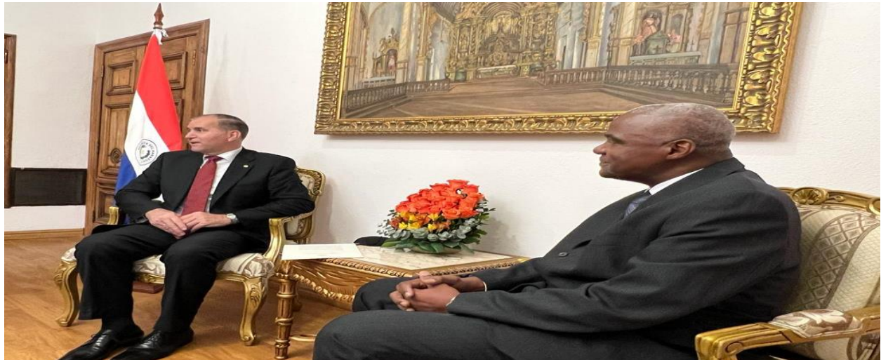
The Ambassador of Trinidad and Tobago presented Copies of his Credentials to the Minister of Foreign Affairs of Paraguay