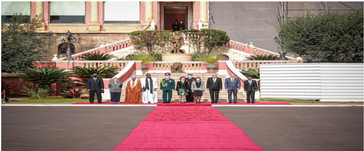
New Ambassadors presented Credentials to the President