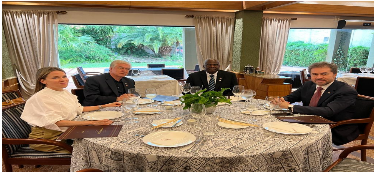
The Ambassador, accompanied by Trinidad and Tobago's Honorary Consul to Asuncion, Paraguay met with the Minister of Trade and Industry (far-right) and the Vice-Minister of Trade and Industry and Head of the Paraguay Export Development Agency / REDIEX (far-left).

Embassy of the Republic of Trinidad and Tobago Brasilia – DF BRAZIL