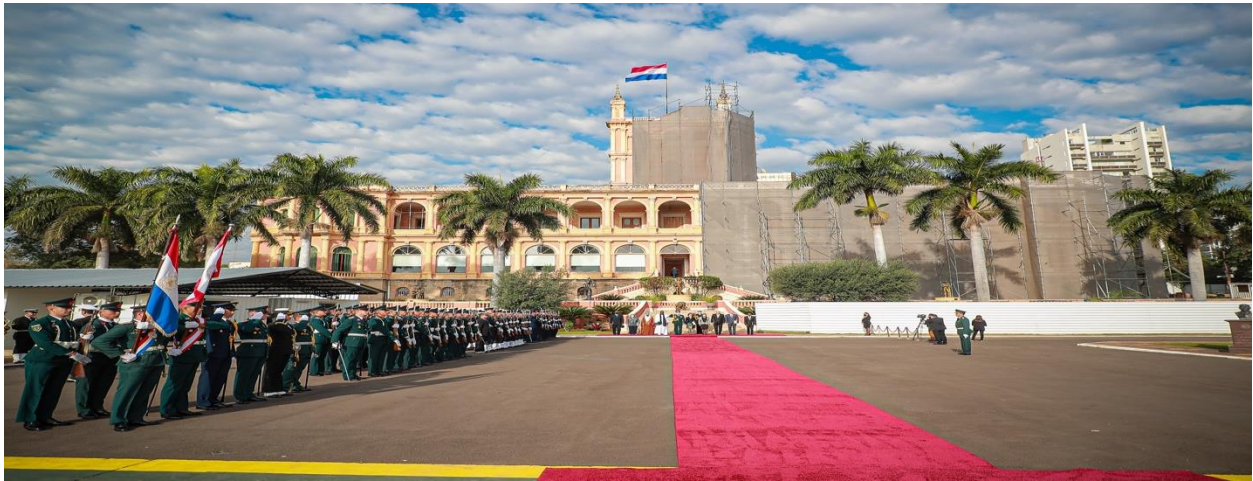
The Presentation of Credentials of Concurrent Ambassadors at a ceremony held at the Palacio de López in Asunción on June 28, 2022