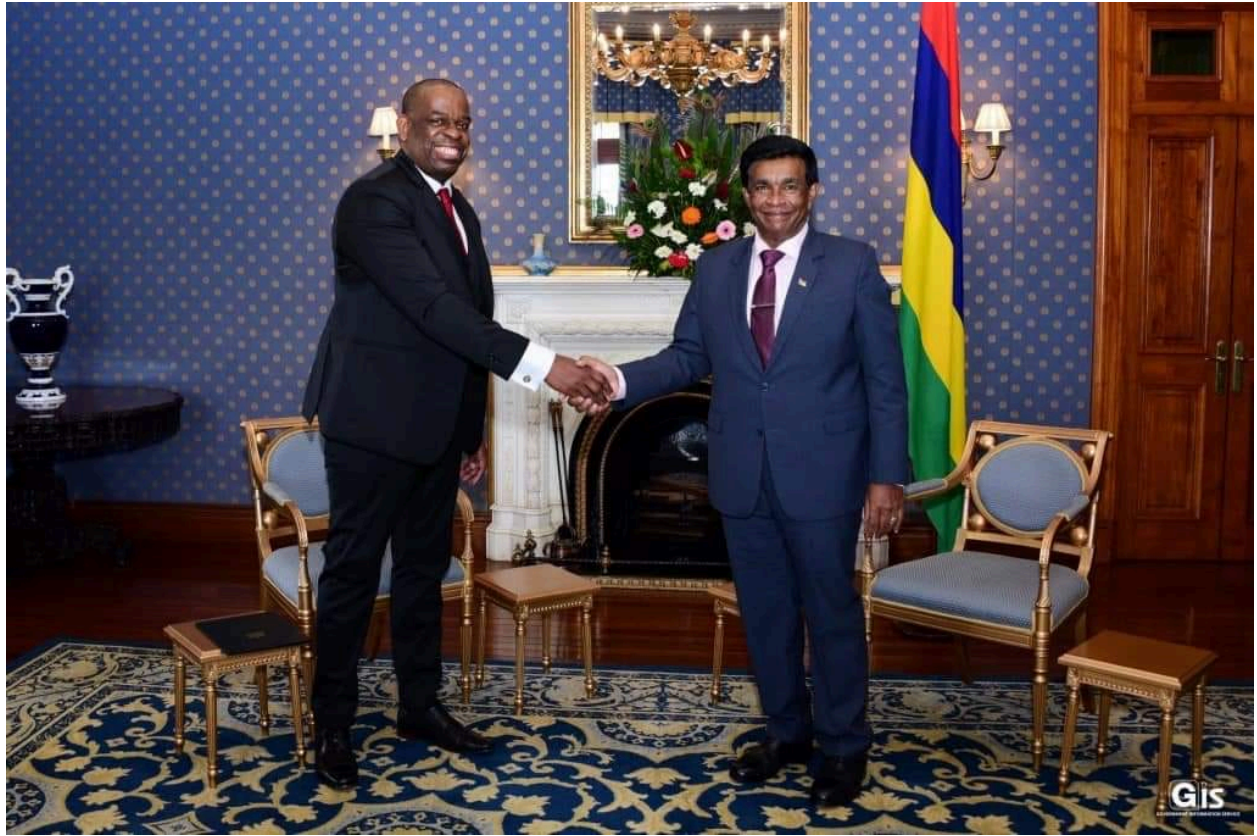
Figure 2: Meeting between the President of Mauritius and the High Commissioner