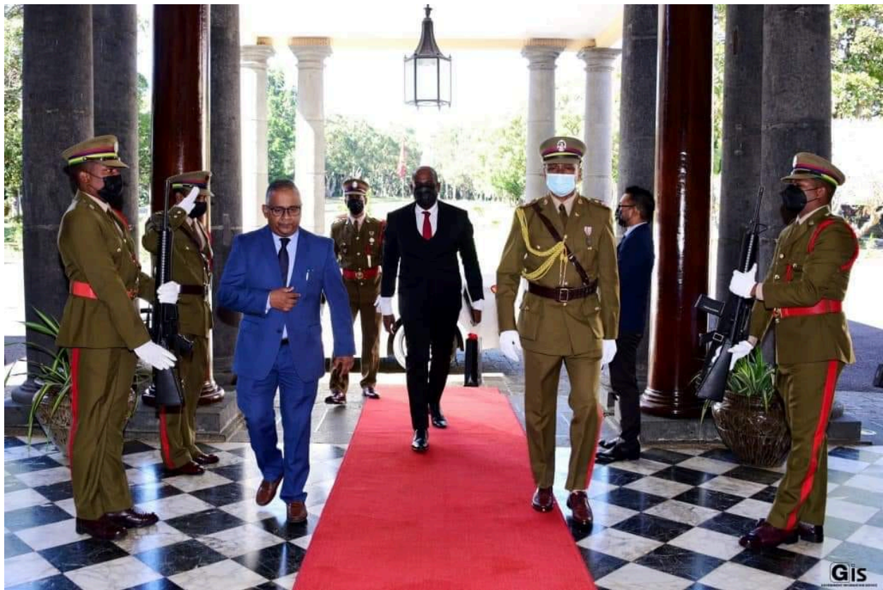
Figure 1: The Presentation of Credentials Ceremony at the State House in Mauritius, July 27, 2022

Trinidad and Tobago and Mauritius established diplomatic relations in June 1974.