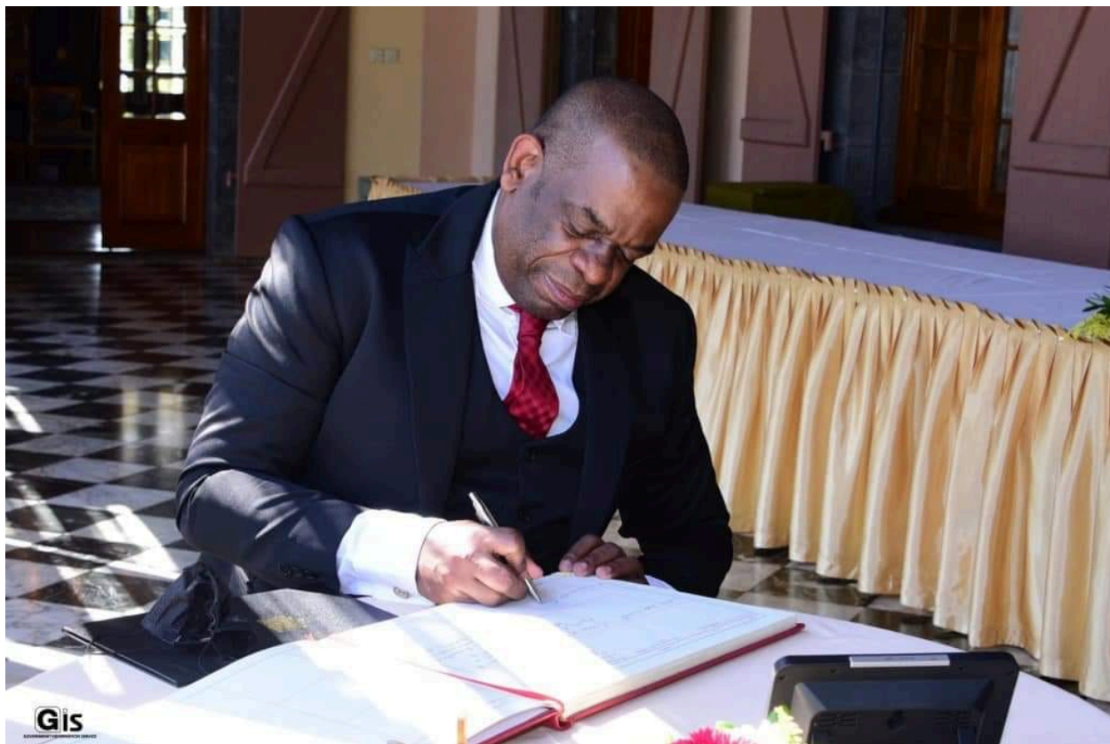
Figure 3: The High Commissioner signing the Guest Book