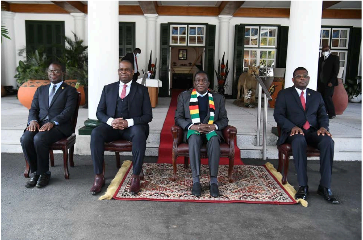
Figure 4: The High Commissioner pictured with the President of Zimbabwe and officials of the Ministry of Foreign Affairs and International Trade