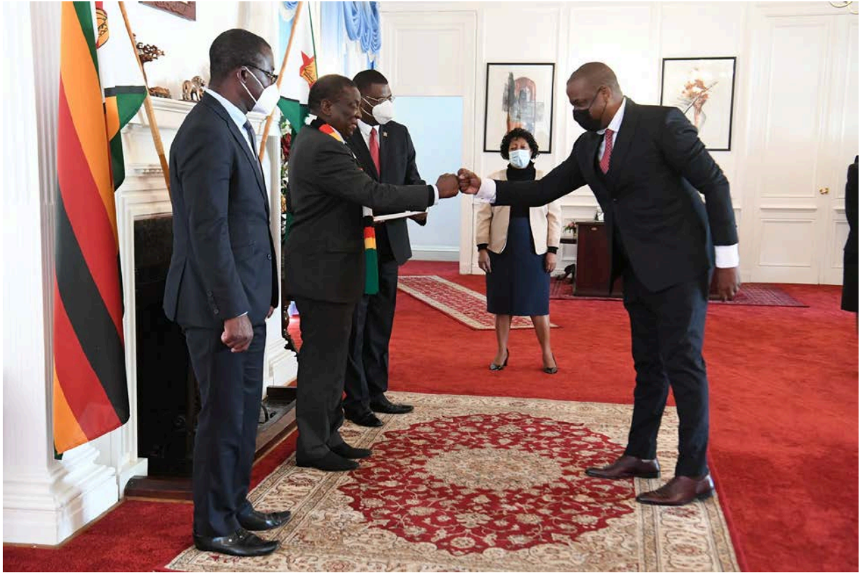
Figure 2: The High Commissioner greeting the President of Zimbabwe on the occasion of the Presentation of Credentials