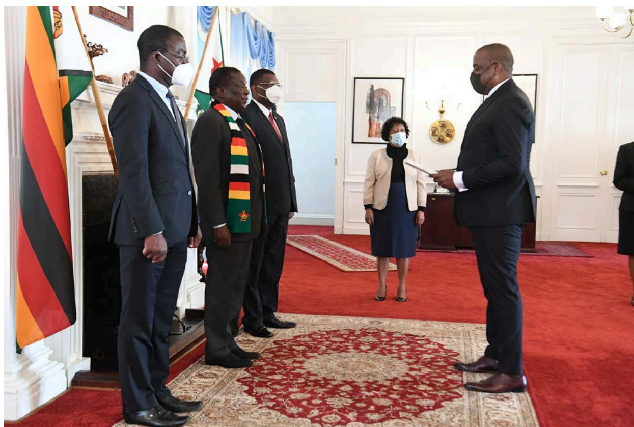
Figure 1: The High Commissioner delivering remarks to the President on the occasion of the Presentation of Credentials

The President and the High Commissioner discussed the longstanding diplomatic relations between Trinidad and Tobago and Zimbabwe and the scope for further discussions on issues of energy cooperation and economic matters, as well as collaboration in the international political arena on issues of importance to the respective countries.