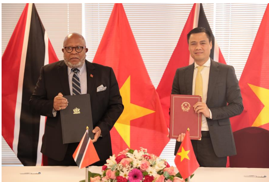
His Excellency Dennis Francis, Permanent Representative of Trinidad and Tobago to the United Nations, New York and His Excellency Đặng Hoàng Giang, Permanent Representative of Viet Nam to the United Nations, New York with the signed Joint Communiqué for the establishment of diplomatic relations.