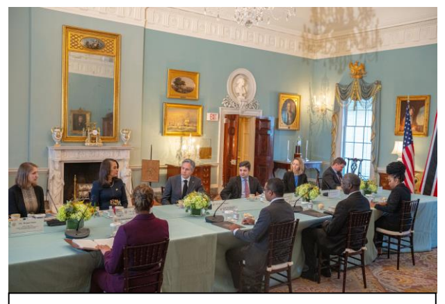
Senator the Honourable Dr. Amery Browne, Minister of Foreign and CARICOM Affairs of the Republic of Trinidad and Tobago and US Secretary of State Antony Blinken and their respective teams hold discussions.

Senator the Honourable Dr. Amery Browne, Minister of Foreign and CARICOM Affairs of the Republic of Trinidad and Tobago and US Secretary of State Antony Blinken.