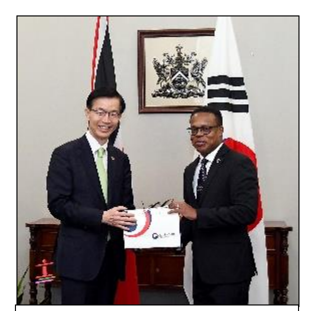
Senator the Honourable Dr. Amery Browne, Minister of Foreign and CARICOM Affairs is presented with a gift by His Excellency Bang Moon Kyu, Special Envoy of the President of the Republic of Korea and Minister of Trade, Industry and Energy of the Republic of Korea.