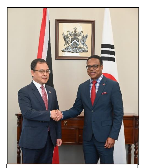
Senator the Honourable Dr. Amery Browne, Minister of Foreign and CARICOM Affairs greets His Excellency Dong-il Oh, Ambassador of the Republic of Korea ahead of a farewell courtesy call on 19<sup>th</sup> July, 2024.

PORT OF SPAIN: 20<sup>TH</sup> JULY, 2024