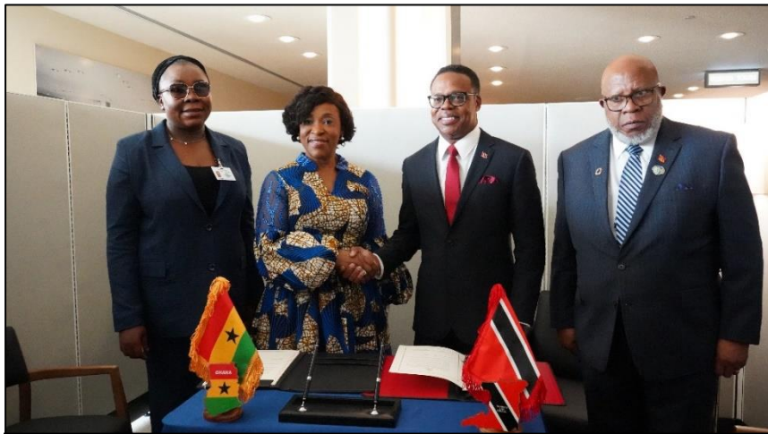
Senator the Honourable Dr. Amery Browne, Minister of Foreign and CARICOM Affairs greets the Honourable Shirley Ayorkor Botchwey, Minister of Foreign Affairs and Regional Integration after the signing an Agreement for the Reciprocal Promotion and Protection of Investments on behalf of the Government of the Republic of Trinidad and Tobago and the Government of the Republic of Ghana during a Signing Ceremony held on 24 th September, 2024. At far right is His Excellency Dennis Francis, Permanent Representative of Trinidad and Tobago to the United Nations, New York.