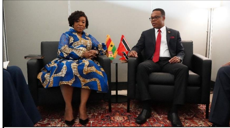
Senator the Honourable Dr. Amery Browne, Minister of Foreign and CARICOM Affairs held discussions with the Honourable Shirley Ayorkor Botchwey, Minister of Foreign Affairs and Regional Integration during a meeting on 24 th September, 2024.