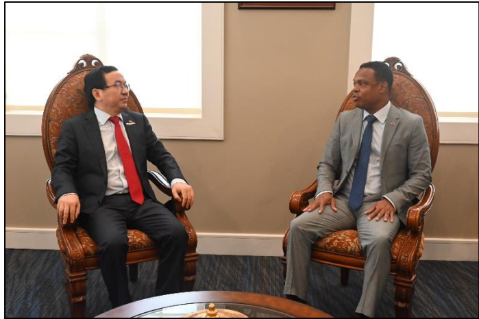
Senator the Honourable Dr. Amery Browne, Minister of Foreign and CARICOM Affairs holds discussions with His Excellency Fang Qiu, outgoing Ambassador of the People's Republic of China during a farewell courtesy call on 7 th October, 2024.