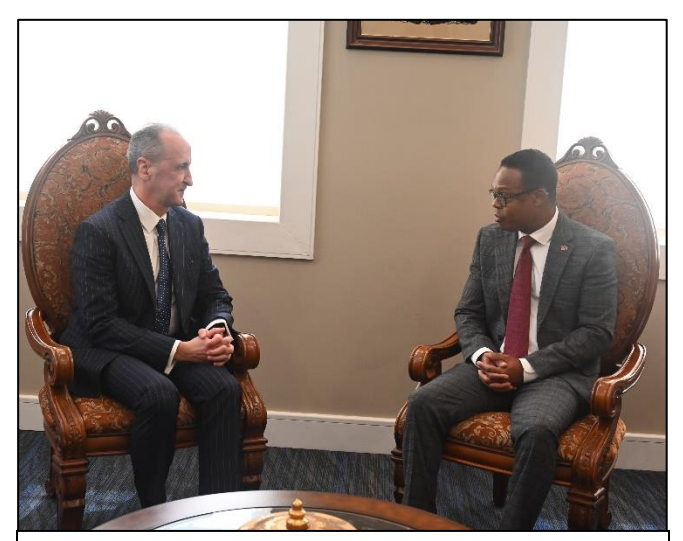
Senator the Honourable Dr. Amery Browne, Minister of Foreign and CARICOM Affairs holds discussions with His Excellency João Pedro de Vasconcelos Fins do Lago, Ambassador-designate of the Portuguese Republic to the Republic of Trinidad and Tobago during a courtesy call on 8<sup>th</sup> October, 2024.

The Government of the Republic of Trinidad and Tobago and the Government of the Portuguese Republic have enjoyed diplomatic relations since 2<sup>nd</sup> September 1977, but consular relations began with the appointment of an Honorary Consul for Portugal in Trinidad and Tobago in 1967.