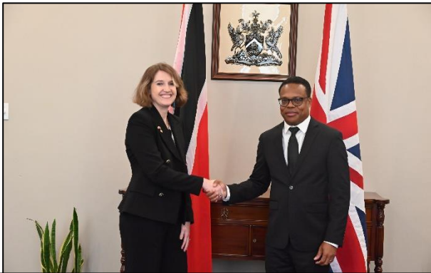
Senator the Honourable Dr. Amery Browne, Minister of Foreign and CARICOM Affairs greets Her Excellency Harriet Cross, High Commissioner of the United Kingdom of Great Britain and Northern Ireland during a meeting on 30 th October, 2024.