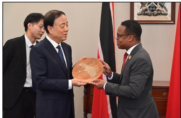
Senator the Honourable Dr. Amery Browne, Minister of Foreign and CARICOM Affairs presents a gift to His Excellency Wu Weihua, Vice-Chairman of the Standing Committee of the National People's Congress of the People's Republic of China during a meeting on 11 th November, 2024.