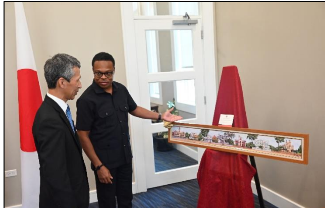
Senator the Honourable Dr. Amery Browne, Minister of Foreign and CARICOM Affairs presents His Excellency Yutaka Matsubara, outgoing Ambassador of Japan with a farewell gift during a farewell courtesy call on 28 th November, 2024.

Senator the Honourable Dr. Amery Browne, Minister of Foreign and CARICOM Affairs bade farewell to His Excellency Yutaka Matsubara, outgoing Ambassador of Japan to the Republic of Trinidad and Tobago during a farewell courtesy call on 28 th November, 2024 at the Ministry's headquarters.