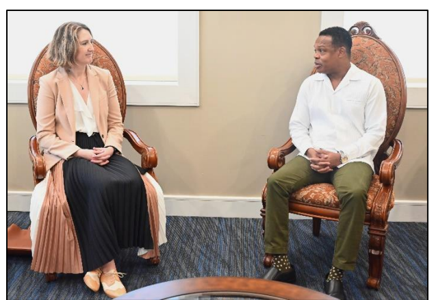
Senator the Honourable Dr. Amery Browne, Minister of Foreign and CARICOM Affairs and Her Excellency Harriet Cross, High Commissioner for the United Kingdom of Great Britain and Northern Ireland during a farewell courtesy call on 3<sup>rd</sup> December, 2024.

Her Excellency Harriet Cross, High Commissioner for the United Kingdom of Great Britain and Northern Ireland paid a farewell courtesy call on Senator the Honourable Dr. Amery Browne, Minister of Foreign and CARICOM Affairs on 3<sup>rd</sup> December, 2024 at the Ministry's headquarters.