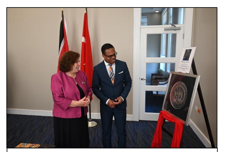
Senator the Honourable Dr. Amery Browne, Minister of Foreign and CARICOM Affairs presents Her Excellency Bengü Yiğitgüden, Ambassador of the Republic of Türkiye with a farewell gift during a farewell courtesy call on 23<sup>rd</sup> December, 2024

Senator the Honourable Dr. Amery Browne, Minister of Foreign and CARICOM Affairs bade farewell to Her Excellency Bengü Yiğitgüden, Ambassador of the Republic of Türkiye to the Republic of Trinidad and Tobago, during a farewell courtesy call on 23<sup>rd</sup> December, 2024 at the Ministry's headquarters.