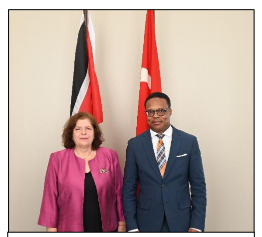
Senator the Honourable Dr. Amery Browne, Minister of Foreign and CARICOM Affairs with Her Excellency Bengü Yiğitgüden, Ambassador of the Republic of Türkiye during a farewell courtesy call on 23<sup>rd</sup> December, 2024.

PORT OF SPAIN: 23<sup>RD</sup> DECEMBER, 2024