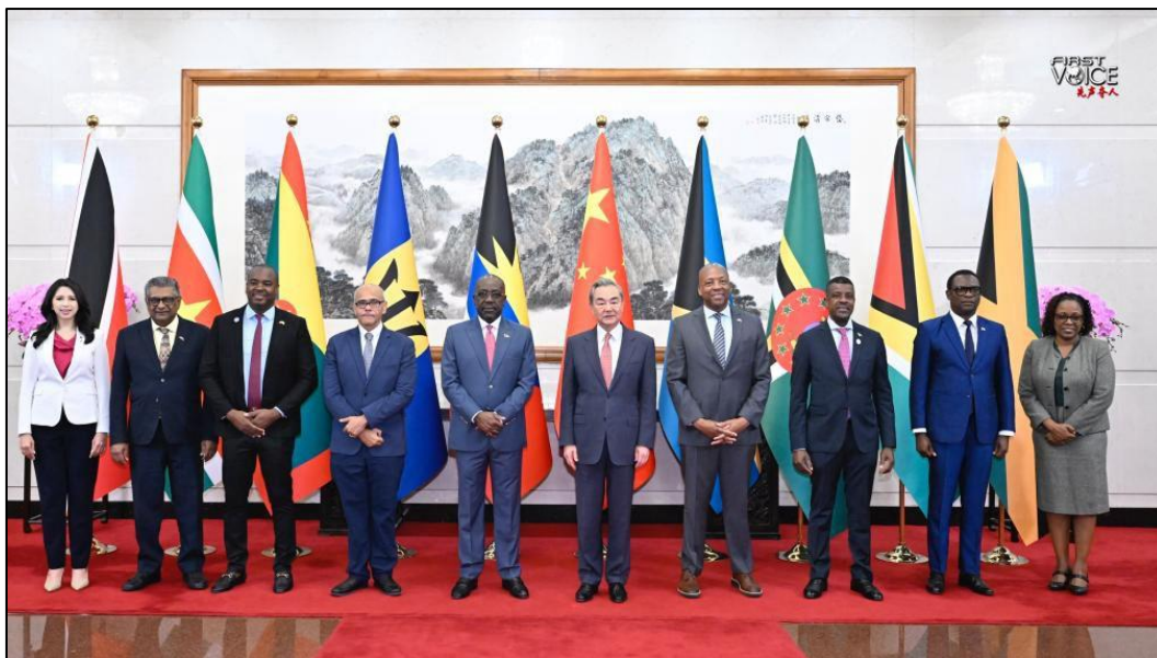
Chinese Foreign Minister Wang Yi (centre) poses for a group photograph with representatives from the Caribbean countries that share diplomatic relations with China, May 12, 2025, at the Diaoyutai State Guesthouse, Beijing