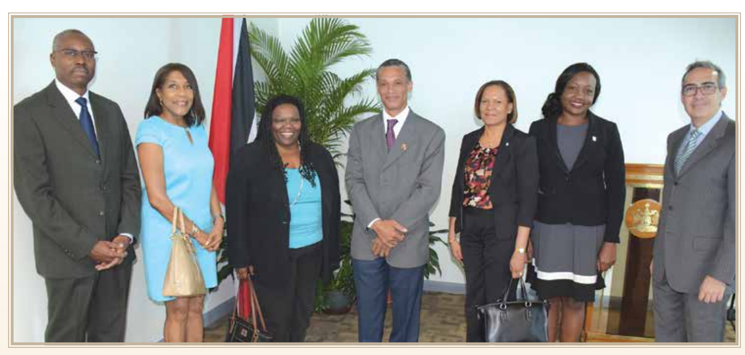
Senator the Honourable Dennis Moses, Minister of Foreign and CARICOM Affairs with representatives of the United Nations Agencies resident in Trinidad and Tobago

enator the Honourable Dennis Moses, Minister of Foreign and CARICOM Affairs, informed members of the Diplomatic Corps and Heads of International Organisations that, "Trinidad and Tobago remains engaged and committed to making its contribution to regional, hemispheric and global affairs and to working with all its partners towards the future we want." Minister Moses delivered the brief remarks on Monday 21st September, 2015 during a meeting at the headquarters of the Ministry of Foreign and CARICOM Affairs.