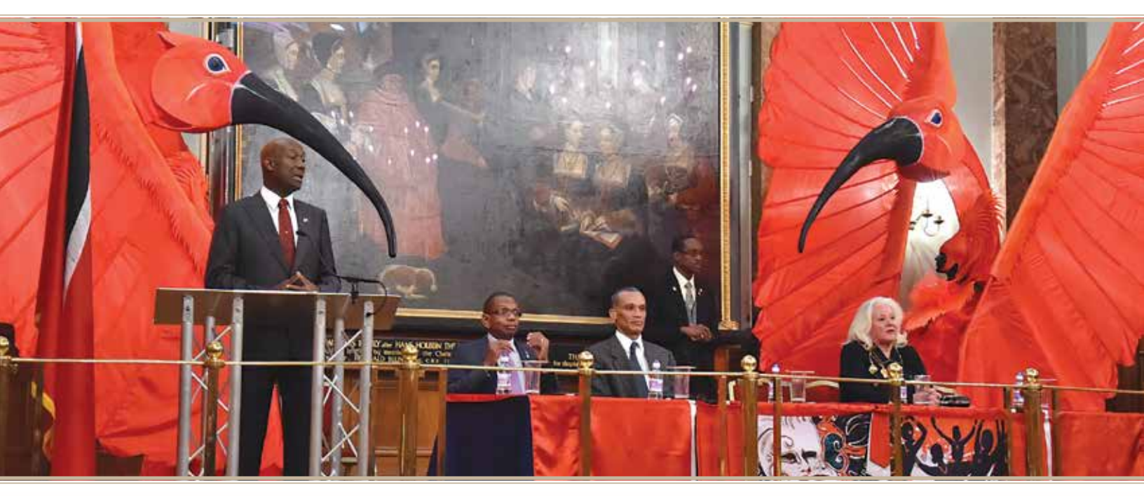
Prime Minister Dr. the Honourable Keith Rowley, Tedwin Herbert, Acting High Commissioner for the Republic of Trinidad and Tobago, London; Senator the Honourable Dennis Moses, Minister of Foreign and CARICOM Affairs and Councillor Julie Mills, Deputy Mayor of the Royal Borough of Kensington and Chelsea, London

r. the Honourable Keith Rowley, Prime Minister of the Republic of Trinidad and Tobago spoke openly to the Diaspora on government's commitment to deal with issues of accountability, transparency in Public Office as well as economic and social challenges. The discussion took place on Monday 30th November, 2015 at Chelsea Old Town Hall, London during the Prime Minister's inaugural visit to the United Kingdom on his return journey from the recently concluded Commonwealth Heads of Government Meeting, which was held in Malta from 27th – 29th November, 2015.