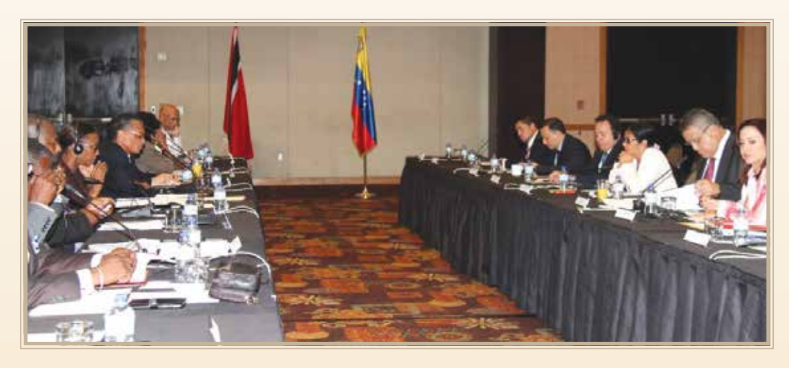
Senator the Honourable Dennis Moses, Minister of Foreign and CARICOM Affairs co-chairs a High-Level bilateral meeting with the Bolivarian Republic of Venezuela in Port of Spain.

Both sides agreed to the establishment, in the short term, of a structured mechanism to operationalise the decisions emanating from the high-level dialogue. discussions laid the foundation for Trinidad and Tobago's participation in the bilateral High Level Consultative Mechanism held in Venezuela on 26th October, 2015. The high-level encounter resulted in a Joint Declaration embodying agreements reached for advancing collaboration in strategic areas of mutual benefit which include energy, trade, security and culture with time-bound undertakings.