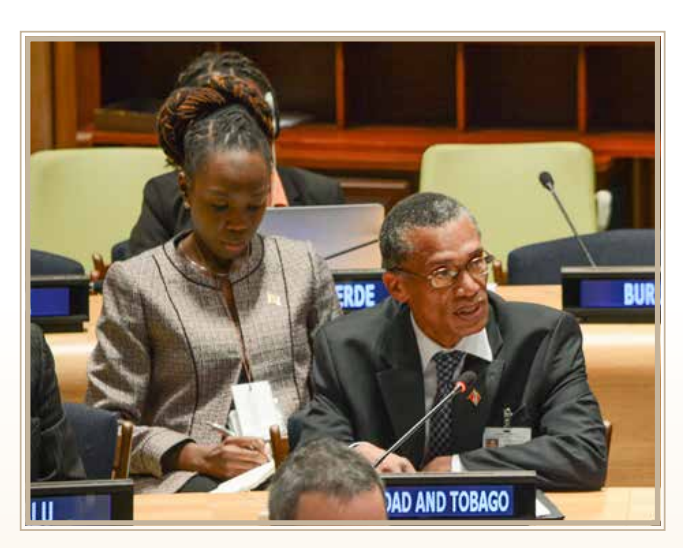
Senator the Honourable Dennis Moses, Minister of Foreign and CARICOM Affairs at the Global Leaders' Meeting on Gender Equality and Women's Empowerment at United Nations Headquarters in New York

enator the Honourable Dennis Moses, Minister of Foreign and CARICOM Affairs, emphasised to the Summit of World Leaders that Trinidad and Tobago's implementation of the 2030 sustainable development agenda will be guided by its own national sustainable development strategy, which seeks to implement the sustainable development goals through twelve strategic priority areas over the period 2015 - 2025. Minister Moses delivered the statement at the United Nations Summit for the Adoption of the Post-2015 Development Agenda which was convened from 23rd to 27th September, 2015 in New York.