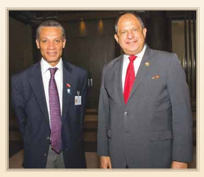
His Excellency Luis Guillermo Solís Rivera, President of Costa Rica with Senator the Honourable Dennis Moses, Minister of Foreign and CARICOM Affairs

In addition to the General Debate, Trinidad and Tobago participated in several high level meetings which included the annual Meeting of Foreign Ministers of the Community of Latin America and Caribbean States; the meeting of the Alliance of Small Island States; the Foreign Ministers of the Group of 77 and China; and the annual Meeting of Commonwealth Foreign Affairs Ministers.