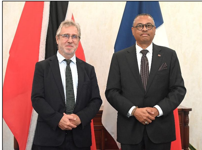
Senator the Honourable Dr. Kennedy Swaratsingh, Acting Minister of Foreign and CARICOM Affairs with Mr. Guillaume Pierre, Ambassador-designate of the French Republic during a courtesy call on 30 th September, 2025.

Mr. Guillaume Pierre, Ambassador-designate of the French Republic, paid a courtesy call on Senator the Honourable Dr. Kennedy Swaratsingh, Acting Minister of Foreign and CARICOM Affairs, at the headquarters of the Ministry on 30 th September, 2025. During this meeting, the Ambassador-designate, on behalf of the French Government, reaffirmed his country's readiness to deepening bilateral cooperation with the Republic of Trinidad and Tobago.