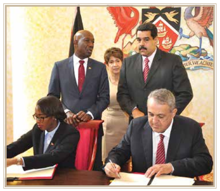
The Honourable Nicole Olivierre, Minister of Energy and Energy Industries and His Excellency Eulogio del Pino, Minister of the People's Power for Petroleum and Mining, Venezuela sign a Memorandum of Understanding

r. the Honourable Keith Rowley, Prime Minister of the Republic of Trinidad and Tobago and His Excellency Nicolás Maduro Moros, President of the Bolivarian Republic of Venezuela, welcomed the signing of the Memorandum of Understanding between the Governments of the Republic of Trinidad and Tobago and the Bolivarian Republic of Venezuela for the Technical and Commercial Studies Related to the Natural Gas Supply from the Bolivarian Republic of Venezuela to the Republic of Trinidad and Tobago on 23rd May 2016. The Agreement was signed by the Honourable Nicole Olivierre, Minister of Energy and Energy Industries and His Excellency Eulogio del Pino, Minister of the People's Power for Petroleum and Mining, during the Official Visit of President Maduro to Trinidad and Tobago.