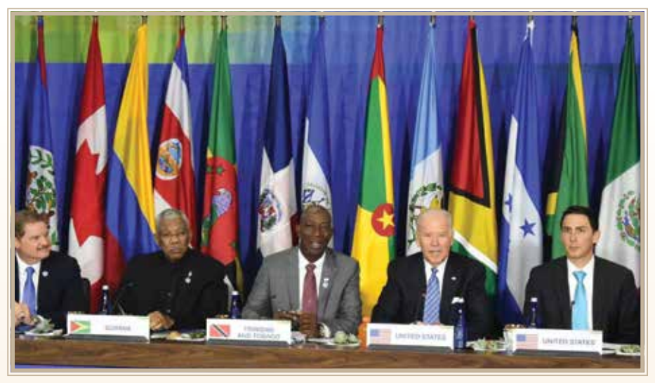
Dr. the Honourable Keith Rowley, Prime Minister of the Republic of Trinidad and Tobago addresses delegates at the US-Caribbean Central American Energy Summit in Washington

The Prime Minister toured the Tema Oil Refinery; the VALCO Aluminium Smelting