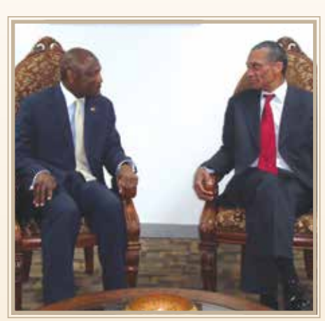
Sen. the Hon. Dennis Moses, Minister of Foreign and CARICOM Affairs greets H.E. John L. Estrada, Ambassador of the United States of America