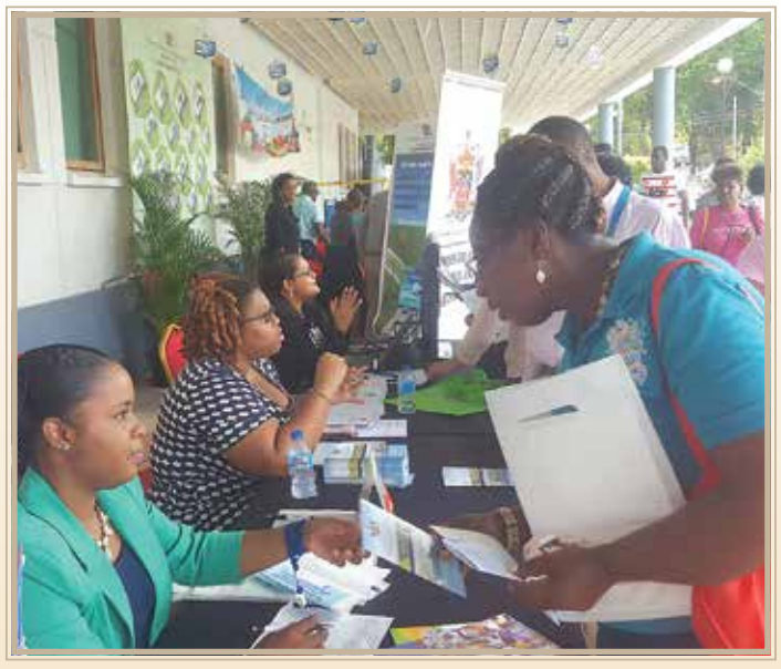
Officers of the Ministry of Foreign and CARICOM Affairs interact with members of the public during the Public Service Open House

n commemoration of United Nations Public Service Week, the Ministry of Foreign and CARICOM Affairs participated in the Public Service Open House on Thursday 23rd June, 2016 held at the National Library and Information System (NALIS) building. The event, which was organised by the Ministry of Public Administration and Communications under the theme, "Innovating for Excellence in Service Delivery," took place during the period 21st to 24th June, 2016.