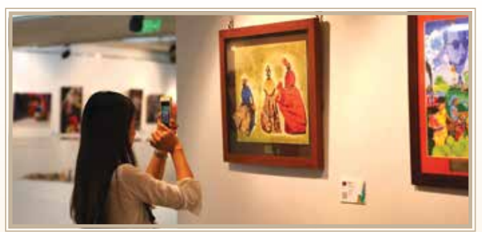
A guest takes a photo of Trinidad and Tobago's display at the Latin American and Caribbean Visual Arts Exhibition

he Embassy of the Republic of Trinidad and Tobago in the People's Republic of China, in collaboration with the Embassies of other English-speaking Caribbean states in Beijing, participated in the China-Latin America and the Caribbean Cultural Exchange Year 2016 during the period 30th April to 26th May 2016. The Cultural Exchange Year has been touted as the most comprehensive cultural exchange programme between China and Latin American and Caribbean countries to date. In this context, the Embassies of Trinidad and Tobago, Barbados, Jamaica, Guyana, Suriname, the Bahamas and Grenada collaborated with the Ministry of Culture of the People's Republic of China and the China Arts and Entertainment Group (CAEG) to organise a series of Caribbean cultural events in Beijing under the umbrella of the Cultural Exchange