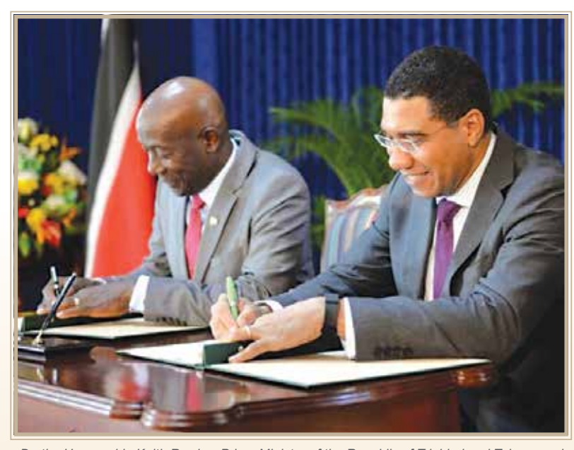
Dr. the Honourable Keith Rowley, Prime Minister of the Republic of Trinidad and Tobago and The Most Honourable Andrew Holness, Prime Minister of Jamaica sign the communiqué which details the results of the bilateral discussions between the two Prime Ministers during Prime Minister Rowley's Official Visit to Jamaica

r. the Honourable Keith Rowley, Prime Minister of the Republic of Trinidad and Tobago, on the invitation of the Most Honourable Andrew Holness, Prime Minister of Jamaica, paid an Official Visit to Jamaica during the period 17th to 21st July, 2016.