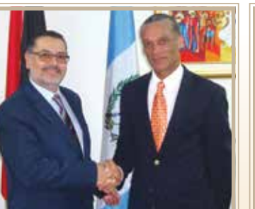
Senator the Honourable Dennis Moses, Minister of Foreign and CARICOM Affairs greets His Excellency Giovanni Castillo, outgoing Ambassador of the Republic of Guatemala at a Farewell Courtesy Call