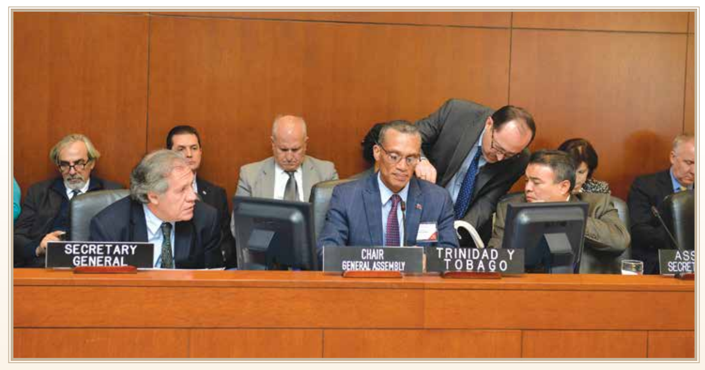
Senator the Honourable Dennis Moses, Minister of Foreign and CARICOM Affairs chairs the 51st Special Session of the General Assembly of the Organization of American States

enator the Honourable Dennis Moses, Minister of Foreign and CARICOM Affairs chaired the 51st Special Session of the General Assembly of the Organization of American States (OAS) which was held on 31st October, 2016 in Washington, D.C., United States of America.