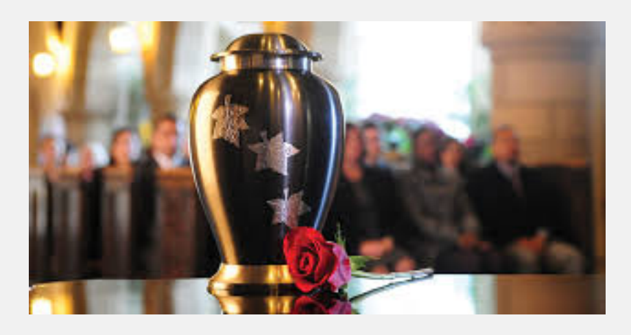
CONSULAR AFFAIRS DIVISION – August 2021

For more information or assistance, please contact the Trinidad and Tobago Embassy, High Commission or Consulate nearest to you. The Consular staff will be pleased to help in any way they can. The Consular Affairs Division can be reached at consular@foreign.gov.tt